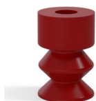
Variant reference: 1 11-2SL A